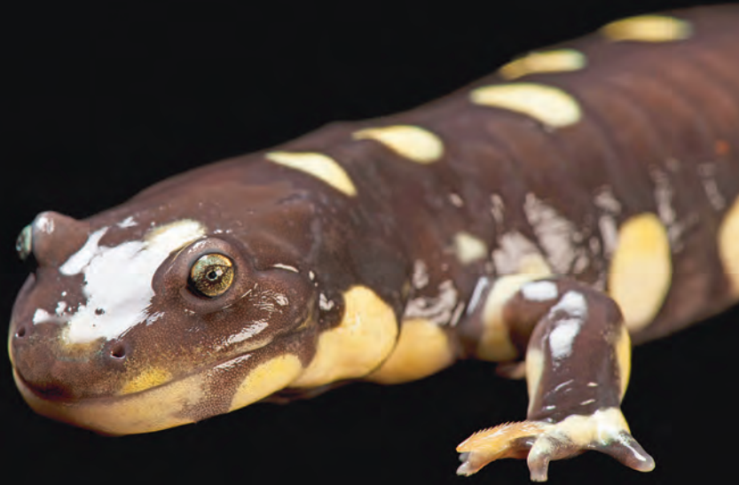
© JOEL SARTORE/NATIONAL GEOGRAPHIC PHOTO ARK (CAPTIVE)