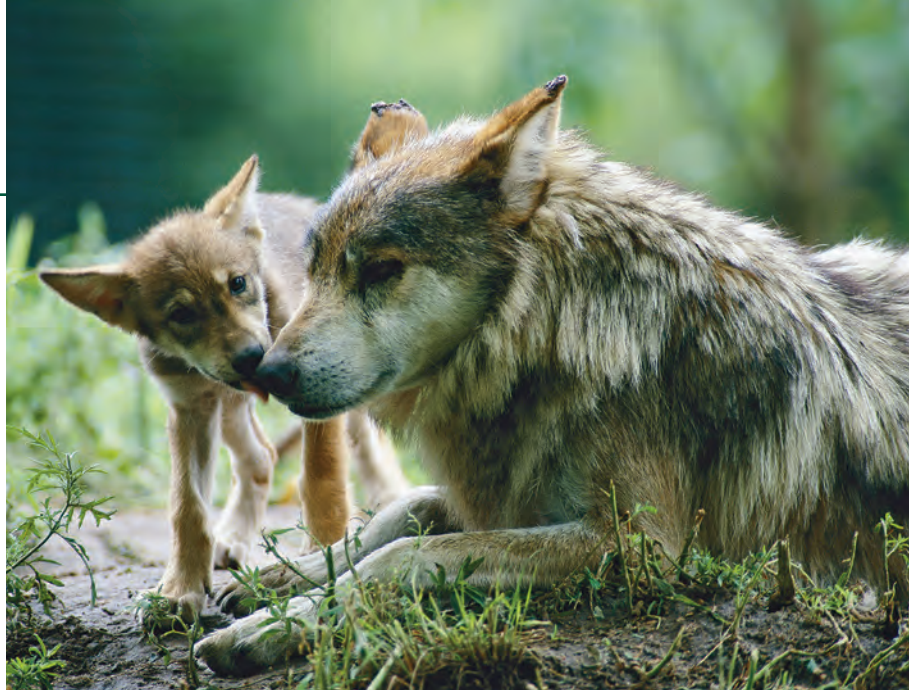
MEXICAN WOLVES (CAPTIVE)