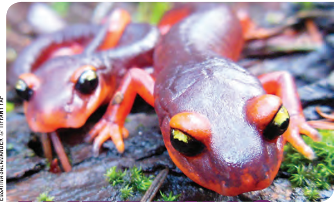
EMILY SALAMANDER © TIFFANY YAP