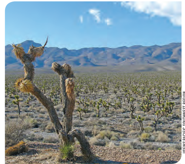
USFWS/PACIFIC SOUTHWEST REGION