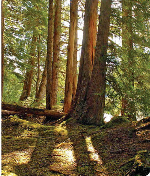
US FOREST SERVICE