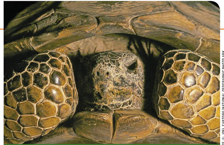
DESERT TORTOISE

After analyzing seven years of U.S. Fish and Wildlife Service (FWS) assessments of 88,000 projects that could impact species listed under the ESA, Defenders found that not one project was stopped because FWS said it would threaten a species' survival. Published in the "Proceeding of the National Academy of Sciences,"—one of the world's top scientific journals—our findings counter arguments from ESA opponents who claim that complying with the law is always onerous. Our findings also raise serious questions about whether FWS is adequately protecting species—a concern we are looking into in 2016.