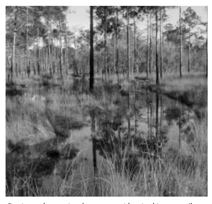
Rutting and vegetation damage are evident in this savanna/bayhead in the Apalachicola.

Coastal marshes also appear to be very sensitive. Needlerush, for example, appears to recuperate poorly from ATV damage, reports soil scientist Lyn Coultas (personal communication 2001). To protect the Cape Sable seaside spar-