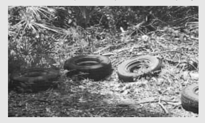
ORV access facilitates illegal dumping of tires and other trash that can hold water and harbor disease-carrying mosquitoes.

Road corridors can serve as conduits for the spread of diseases (Dawson and Weste 1985; Gad et al. 1986; Pantaleoni 1989; Schedl 1991). For example, Aedes mosquitoes, vectors for many dangerous tropical diseases, have spread through the southeastern