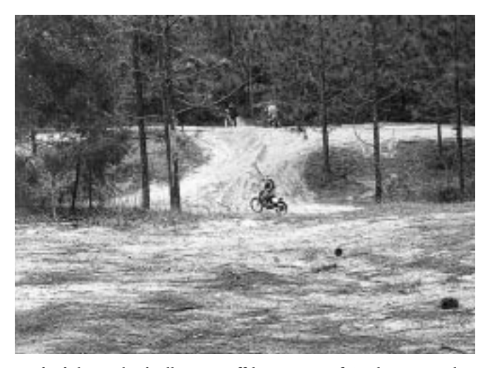
A dirtbiker seeks thrills in an off-limits area of Ocala National Forest popular with ORVers.

The Ocala is rolling land with deep sandy soils. The world's largest contiguous sand pine forest covers most of the Ocala, but it also has substantial areas of oak scrub, sandhill, some mesic forest and numerous sinkholes, lakes, ponds, springs, streams and associated wetlands.