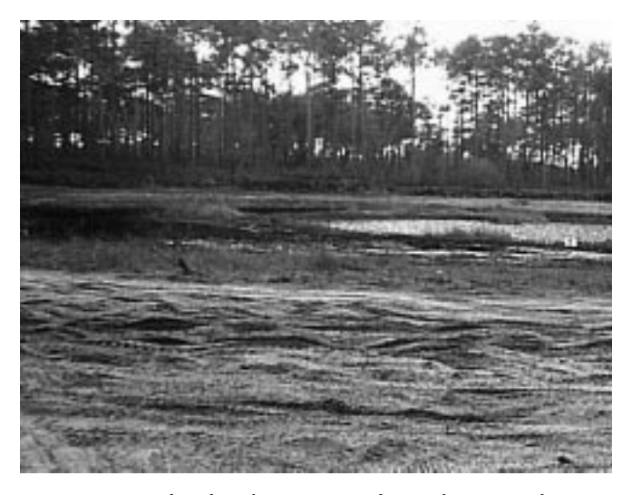
Once pristine Church Lake Prairie in the Ocala National Forest now damaged by ORVs.

Clewell notes that "Little longleaf pine-wiregrass ecosystem remains in the Southeast, relative to what existed a century or more ago. Only a small portion of the remaining acreage can be considered ecologically healthy, and most of that acreage occurs on public lands. This acreage deserves protection and careful management. It would make no sense to condone harmful ecological impacts to intact parcels of this ecosystem on public lands. On the contrary, since public tax dollars are already dedicated to restoring this ecosystem on federal lands, the allowance of any land use that threatens the ecological health and integrity of this ecosystem would represent fiscal irresponsibility."