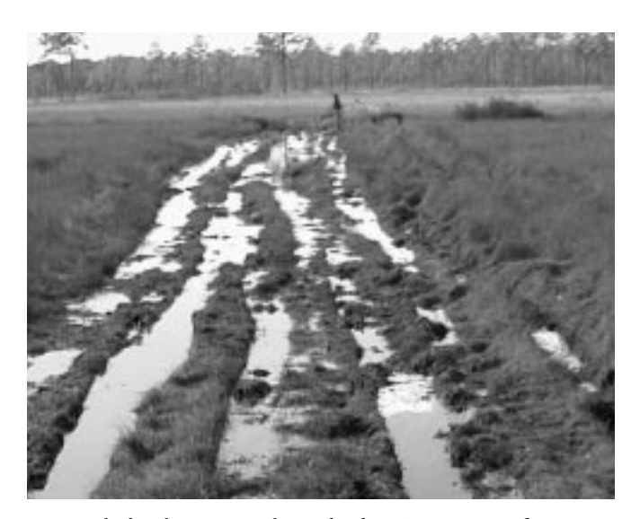
An Apalachicola savanna shows the deep ORV rutting from which savannas are slow to recover.

Pushing road density beyond acceptable limits in the forests are the thousands of miles of user- created ghost roads that are not officially recognized and roads that are closed to the public and do not appear on maps.