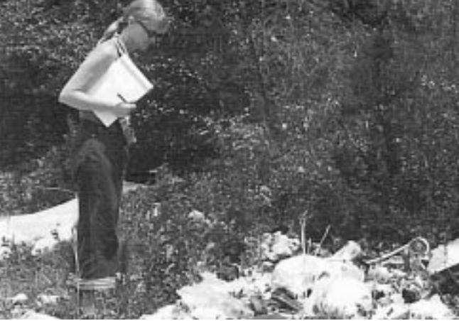
Unauthorized ORV trails make it easy to dispose of trash illegally in Ocala National Forest. The dumpsite at top is in an endangered red-cockaded woodpecker colony in the Ocala.

back out again, but this doesn't always seem to be the case. Areas of heavy ORV use, which are generally those closest to urban areas, tend to have more trash than other places. Compounding the problem are people who use 4WD vehicles to dump household garbage in the forests and other natural areas. This has