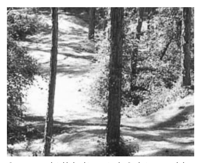
Once a pastoral sinkhole, this area in the Ocala is now eroded and ringed with ORV trails.

The Ocala's problems are compounded by the forest's popularity as a site for organized ORV rallies and races. These widely advertised events attract large numbers of users from