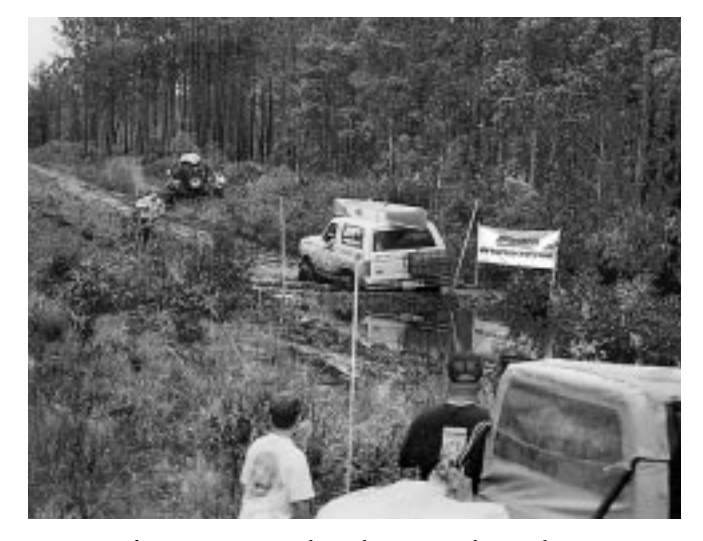
Organized ORV events such as this one in the Ocala pit man and machine against the environment.

(personal communication 2000) expressed concern about erosion and sedimentation impacts from vehicles going over a streamside berm during the 1997 Hummer Challenge in Ocala National Forest.