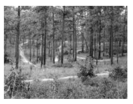
ORV trails fragment the longleaf pine-wiregrass ecosystem in the Ocala National Forest.

As ORVs have gained in popularity, they have also gained in power. Technological advances have spawned ORVs powerful enough to tackle even the most challenging backcountry terrain, while the growth and profitability of the ORV business have given rise to a powerful industry lobby.