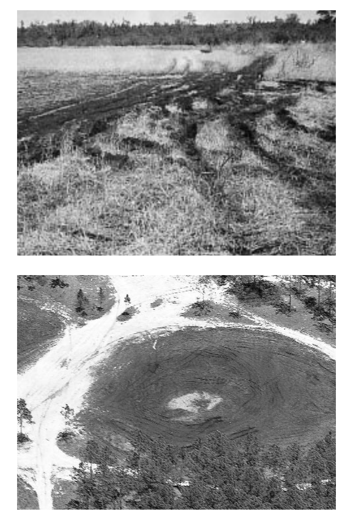
Top: ORVs ruts such as these around Grassy Pond in Ocala National Forest have damaged 80 percent of the wetlands in restricted areas of the Ocala. Bottom: An ephemeral wetland in the Ocala shows the denuded margins created by ORV traffic.

U.S. Fish and Wildlife Service (FWS) and found that every one had been seriously damaged by encircling ORV traffic. Aerial surveys of Ocala National Forest conducted by Defenders of