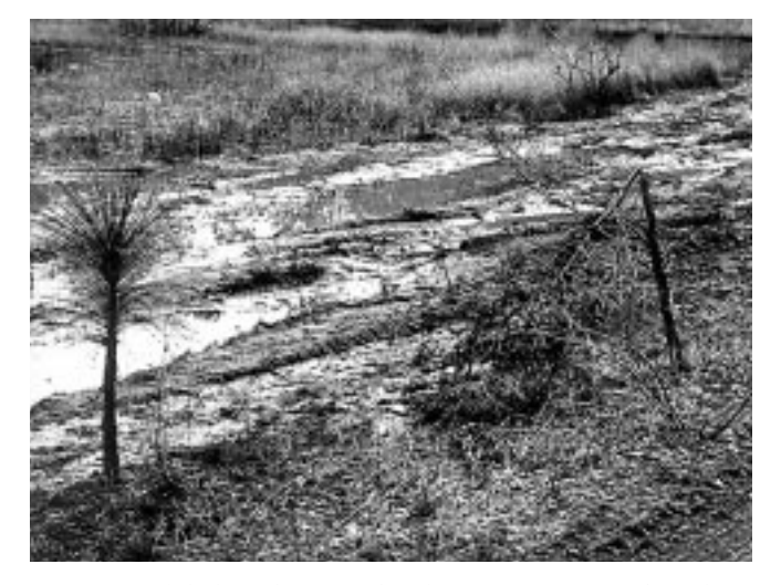
ORVs wreak habitat havoc in fragile riparian areas such as this one in the Ocala.

Florida Natural Areas Inventory zoologist and turtle expert Dale Jackson (personal communication 2001) points out that oil and gas leakage from ORVs might contaminate critical turtle breeding sites in isolated ponds and affect the tadpoles and small aquatic organisms that form the food base for turtles and other larger animals. Chicken turtles, mud turtles and striped mud turtles are the species most likely to