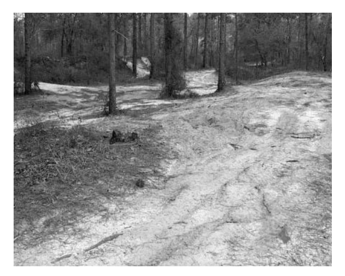
Trails broaden rapidly with repeated ORV traffic on deep, sandy soils such as these in the Springhill area of Apalachicola National Forest.

following description from the website promoting the 2000 Safari Triathalon in Ocala National Forest: "The event will consist of [sic] navigating 300 to 400 miles through water, desert-like sand, slick deep mud, sometimes in the dead of night, by compass, with longitude, latitude and dead reckoning skills... Both person and machine are tested to their limits throughout a wide variety of challenges that might include deep water, steep twisty trails, or battling