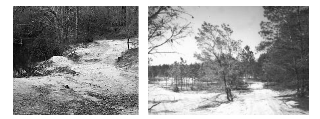
ORV is damage is painfully evident in Florida's national forests: Left: Silted-in Fisher Creek in the Apalachicola ; right: Devastated Penner Ponds in the the Ocala.