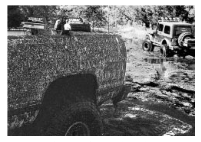
ORVs tear up the terrain.

Wetlands and aquatic systems are particularly sensitive to roads and ORV traffic (Schubert