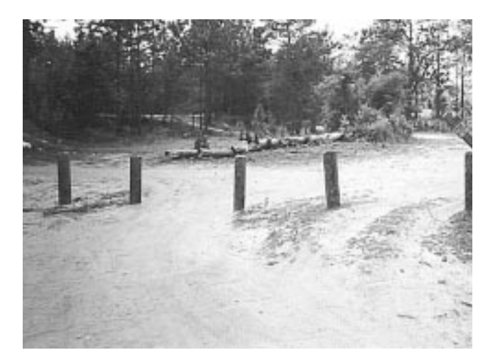
Barriers, such as these posts marking a closed area in the Ocala, are often ignored by ORVers.

A few of the affected areas have been docu-