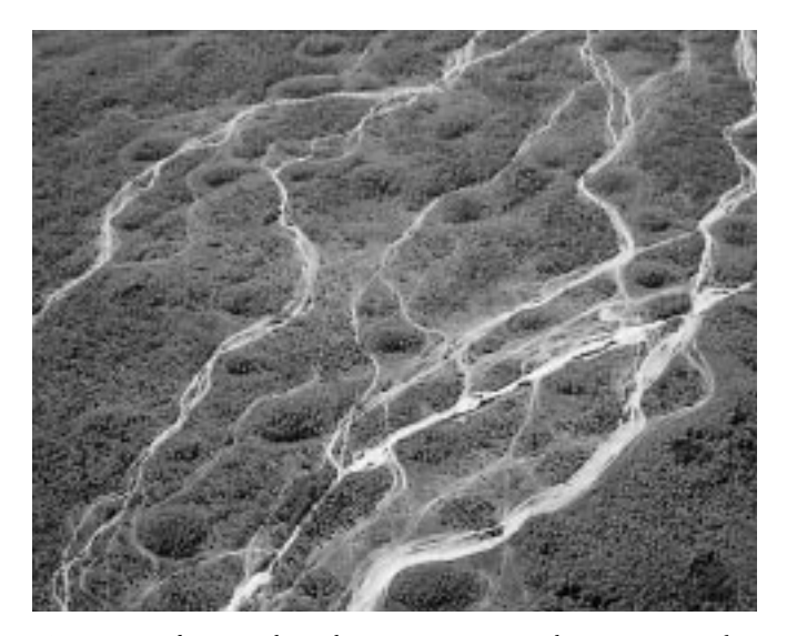
ORV-created ruts such as these crisscross more than 22,000 miles of Big Cypress National Preserve.

Webb and Wilshire (1983) reviewed the reasons why ORV use is prone to causing serious resource damage. One reason is that ORV users can move faster, cover much longer distances