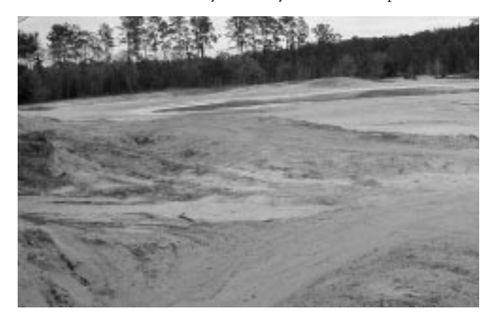
This wetland in the Apalachicola has been devastated by ORV traffic.

Bruce and Ryan Means (2001) are assembling data on ORV impacts to isolated wetlands. Based on amphibian surveys of 300 Apalachicola National Forest ponds they have conducted over the last four years, they believe these ponds are