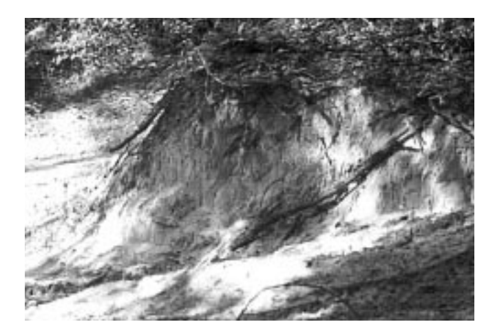
In the Ocala, ORVs have caused severe erosion and root exposure such as this.

Once recreational activities initiate erosion, wind and water carry on the process (Hammitt and Cole 1987). Water is the primary agent of soil erosion in most situations, although wind erosion is an important factor on peaty or sandy