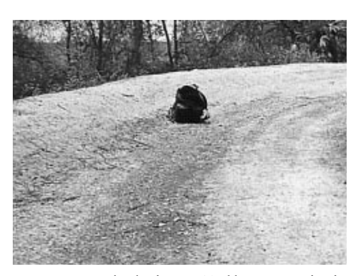
ORV intrusion to the Florida Scenic Trail leaves it scoured and widened into a road.

Noisier, more consumptive and less contemplative recreationists such as ORVers tend to drive out quieter, less consumptive, and more contemplative users (Badaracco 1978 in Sheridan 1979). Badaracco (1978) describes a disturbing progression of ORV dominance over other uses that he calls "ISD" (Impair, Suppress, Displace). ORVs tend to first impair other activities, then suppress, then displace them, thereby shrinking the amount of land available for non-ORV recreation. "The irony of the ISD syndrome is that administrators and managers tend to measure recreational demand on the basis of current participation rates, says Badaracco."Thus the administrator may allocate additional opportunities to a group which has suppressed or displaced a former traditional group" and "change the character of outdoor recreation despite the intense feelings of a broader public" (Badaracco 1978 in Sheridan 1979). This is exactly what is happening in the Florida national forests.