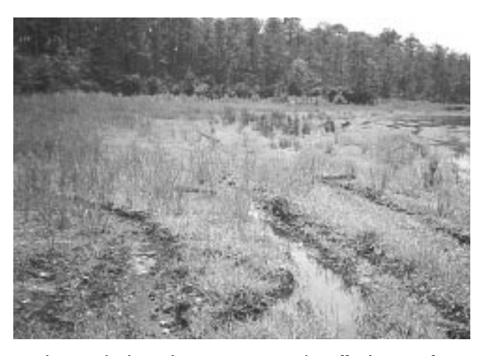
In the Osceola, heavy hunting season truck traffic does significant damage to wetlands such as this one.